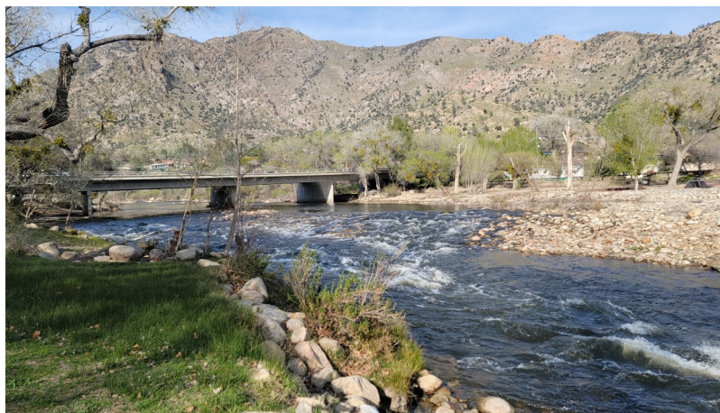
Kern River, flowing through Kernville. Couple steps from our room

Kurt and I drove to Kernville mid-day Thursday, fished a couple hours on our own (to no avail) and then found our room at Kernville Inn. Accommodations were very adequate and walking distance from the fly shop and several good restaurants.