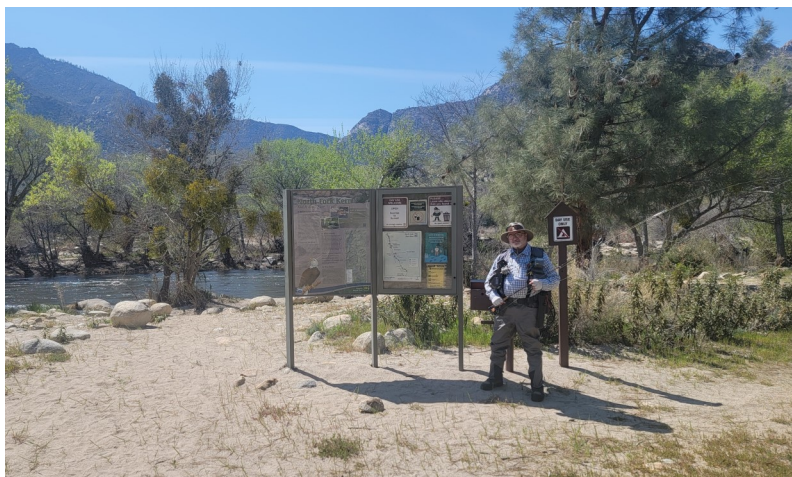
First stop, first afternoon. A couple miles upstream, no luck that day